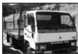
1991 Mitsubishi Flat Bed Lic. #4F72157 $3,500