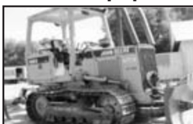
2000 JD450G Dozer, 6 way blade, HMR 3140 $25,000