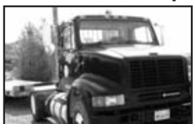
1999 International Lic. #8R16635 $8,000

A few examples of our vast selection of equipment and vehicles