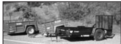
TRAILERS - ALL TYPES AND SIZES