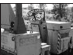
Case 252 Asphalt Roller $3,000