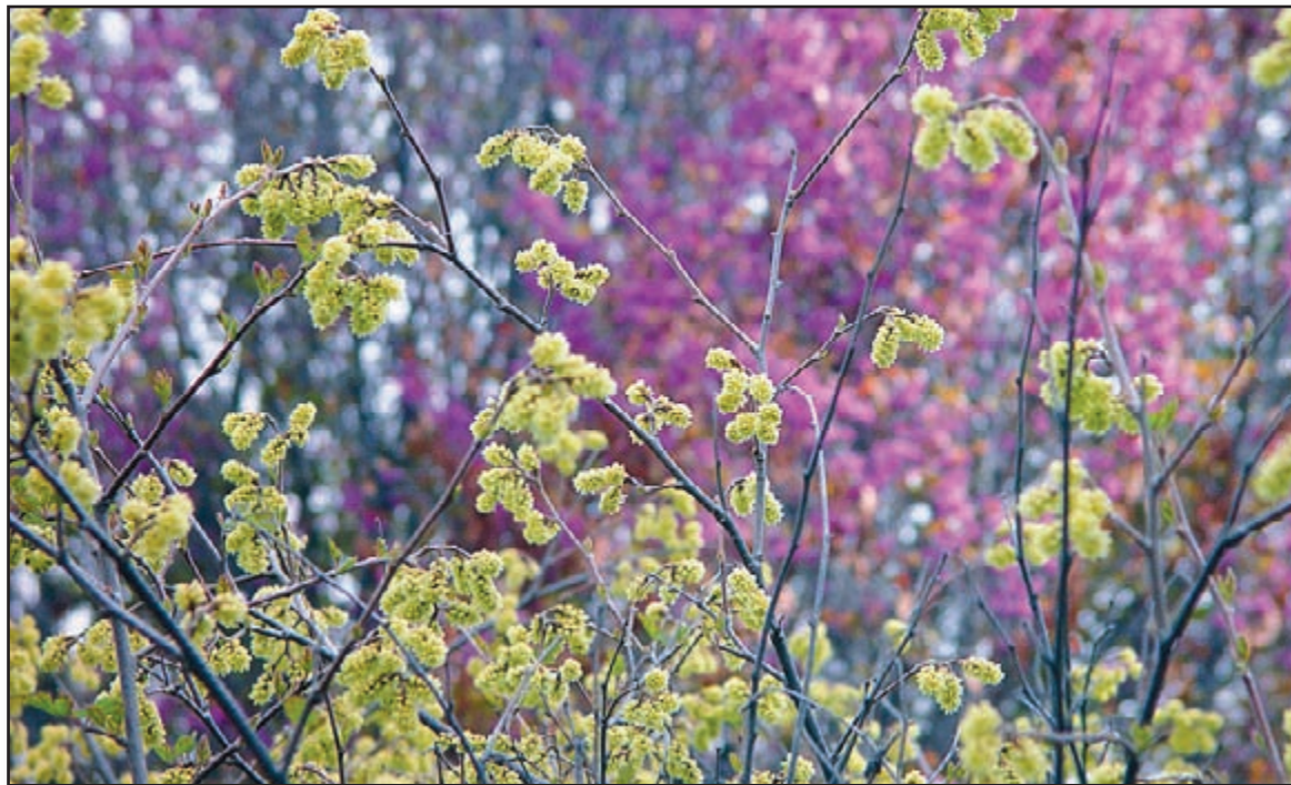
THE YELLOW-GREEN FLOWERS OF A SOURBERRY ( RHUS TRILOBATA ) STAND OUT AGAINST THE PINK BACKDROP OF A REDBUD ( CERCIS OCCIDENTALIS ), BOTH OF THEM IMPORTANT BASKETRY PLANTS FOR AMERICAN INDIANS OF THE SIERRA FOOTHILLS. "CALIFORNIA INDIAN USES OF NATIVE PLANTS" IS THE TOPIC OF THE YOSEMITE AREA AUDUBON SOCIETY'S MONTHLY PROGRAM.